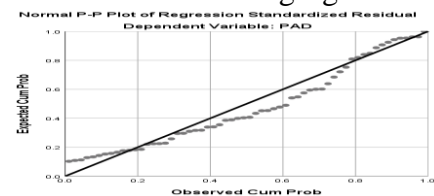
Figure 1. Normality test results

The test results of the normality test can be seen in the following figure: