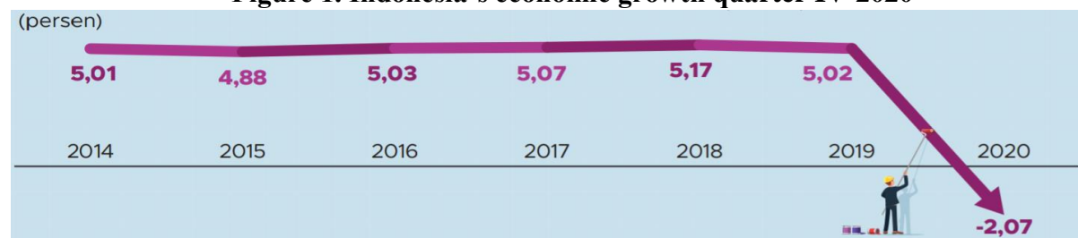
Figure 1. Indonesia's economic growth quarter IV-2020

Besides that, these policies also have led to massive unemployment and business failure (Zhang et al., 2020). Before the pandemic, the Indonesian economy was still shrouded in optimism that 2020 will be better than 2019, as shown in the positive percentage in Figure 1. The Composite Stock Price Index (IHSG) also reached 6,385 in early January 2020 and when this pandemic emerged, it then fell to the level of 5,361 as the closing price of trading during the announcement of the first Corona case and continued to fall below the level of 4,000 at the end of March (Berita Satu, 2021; CNBC Indonesia, 2021).