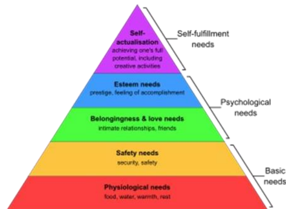
Figure 1. Maslow's hierarchy of needs.

Kotler & Armstrong (2018) defined customer wants as a type of human needs that influenced by personality, culture, knowledge, experience, and etc. No wonder that for similar needs, each person may have different wants. For example, in order to fulfil the basic needs for food, all places have their own special dishes characterized by culture, and tradition. However, in order to realize the demands, one needs to consider their ability to pay. It is called customer demands. Consequently, customer demands serve for only specific customer based on their ability to pay. Therefore, if the ability to pay for customer wants increase or decrease then the customer demands will also be changing according to the ability to pay. On the other words, customer demands will not be permanent.