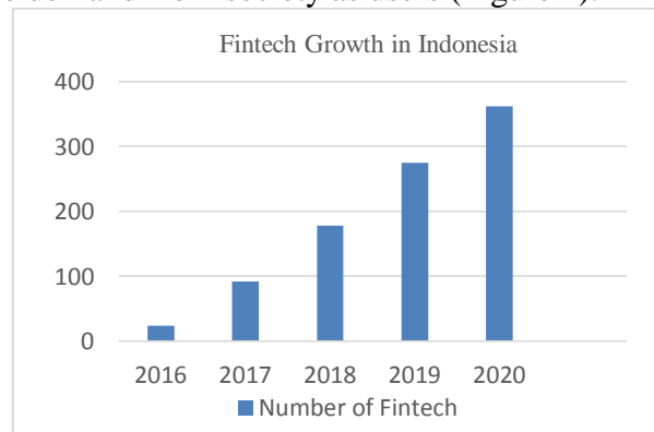
Figure 1. Fintech growth in Indonesia