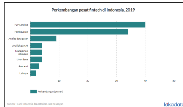
Figure 2. Fintech Segmentations in Indonesia

Fintech in Indonesia is divided into several sectors according to the services offered to users. Based on data compiled by lokadata.id in 2019, Peer to Peer (P2P) Lending occupies the highest position (40%). Then followed by payment sector fintech 34%, market data analyst 9%, analytics and artificial intelligent 4%, wealth management 4%, crowdfunding 4%, insurance 3%, and others at 2% (Lokadata, 2019) (Figure 2).