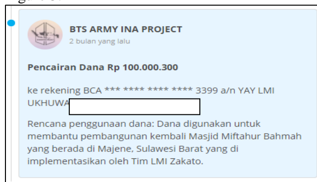
Figure 3. Donation usage report

Kita Bisa Foundation's obligation as the organizer of PUB for collecting money and goods is to distribute the collected donations following the usage plan as specified in the permit decision. Furthermore, Kitabisa must also report the fund receipt and the fund usage accompanied by evidence as responsibility. Regarding donation distribution, kitabisa.com provides transparent information to the public through a report that can be accessed in each campaign, as shown in Figure 3.