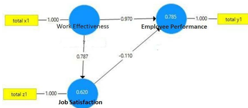
Figure 2. Model test results

Hypotheses test and also the coefficients of direct influences between the research variables will seen from significant value of the path coefficients and critical point (CR) is 0,05 which may be seen within the path diagram represented in Figure 2.